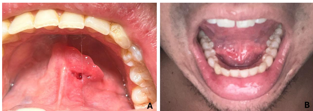
Figure 3. A. Final appearance 15 days postoperatively. B. Final appearance 90 days postoperatively, showing a satisfactory outcome with no signs of complications.

Treatment of sialolithiasis varies according to the size and location of the stones. Small and asymptomatic calculi may be managed conservatively with measures such as hydration, sialogogues, and gland massage. On the other hand, larger and symptomatic stones that obstruct salivary flow require surgical intervention [10]. The choice of surgical technique depends on the sialolith's location: calculi located in the anterior or middle third of the duct may be removed via intraoral surgical exploration, while those located more posteriorly may require sialoadenectomy [11].